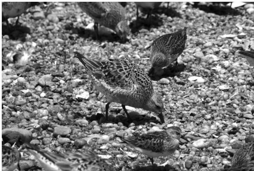
Red knot ( Calidris canutus) feeding at Delaware Bay.