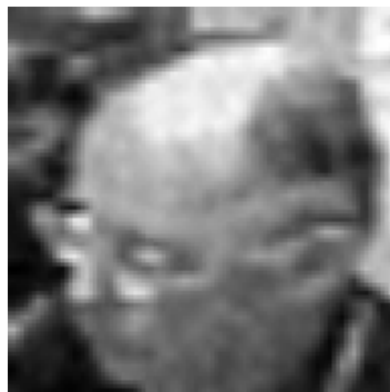
Fig. 1. Experimental results: (a) Nearest neighborhood interpolation, (b) Bilinear interpolation, (c) Proposed algorithm with the following parameters: The original image sequence is of size 32 \times 32 , i.e., M = N = 32 , of a k = 20 frames sequence. The HR counterpart of second frame, i.e., i = 2 is desired. Additive white Gaussian noise of \sigma = 0.05 is added. Neighborhood of radius d = 4 , search window radius r = 13 , zooming parameter z = 3 , and smoothness parameter h = 0.08 .