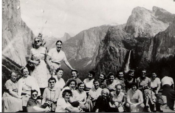
Lapins during their stay in Yosemite National Park. In the background Yosemite Falls