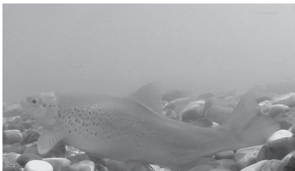
Figure 1. Female softmouth trout probing substrate with her anal fin.

7-10, 2013 in Proložac near Imotski (43.2712 N, 17.1025 E, 270 m altitude). The 2011 recordings were taken from the riverbank using a tripod and a Sony HDR-HC7 video camera. The 2013 recordings were done underwater using Gopro cameras ( www.gopro.com ) mounted on stationary underwater tripods. As in Neretva, the Vrljika females did not show marked sexual dimorphism and behaviour was used to infer the sex.