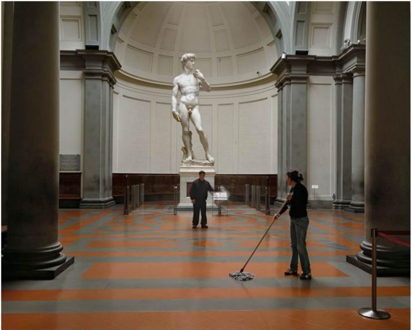
Photographed at Galleria Dell' Accademia In Florence, Italy, With Permission of Ministry Of Heritage And Culture

In Michelangelo's famous rendering of David, the young warrior strikes a heroic pose as he prepares to battle the giant Goliath, a Philistine enemy of Israel. Whether David was a powerful king or simply a local chieftain is hotly debated among scholars.