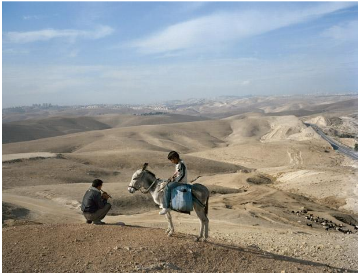
A herder serenades his goats near Jerusalem, a few miles from where David tended his herds.