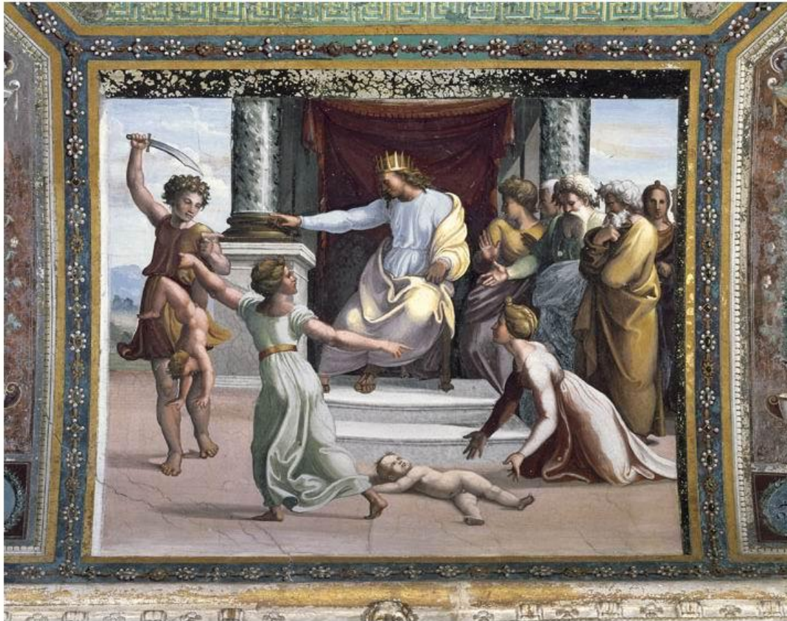
Artwork by Raphael, "The Judgment of Solomon"; Photograph by SCALA/Art Resource, NY

A painting depicts Solomon's wisdom: When two women claim a baby, he orders it divided by a sword; the woman willing to give up the baby is its mother.