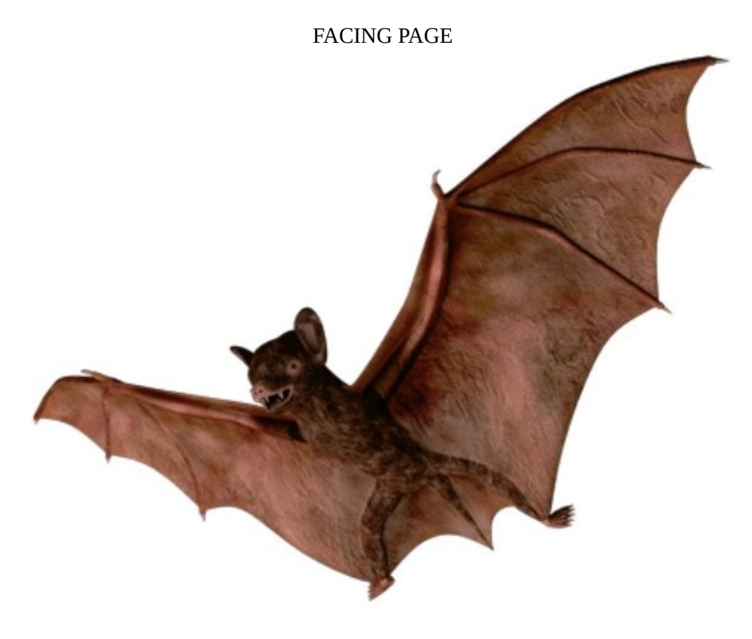
PLATE I: COPULA/AUXILIARY

Bare adjectives can function as predicates, as in (1a, c), above; however, there is a restriction. Unlike verbs, which can be predicated of any subject, adjectives may only appear bare when predicated of an inanimate subject. If the subject is animate, on the other hand, the adjectival predicate must be the complement of a copula BAT. These facts are demonstrated below. Body parts and weather, being inanimate, can be subjects of bare AP predicates, as in (1a, c). However, when the subject is animate, as in (1b), the AP always cooccurs with a copula BAT.