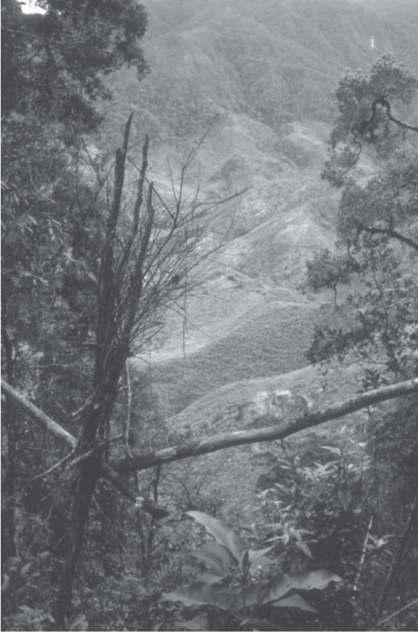
Plate 1 Typical lemur habitat at Bezavona (Site 2; Fig. 1) in Fandriana-Marolambo Forest Corridor. Light areas in background are slash-and-burn agriculture on hill slopes (note plume of smoke in top right corner, indicating active deforestation). A lemur snare-trap used by local people is in the foreground.

during 20 October–4 November 1999 at sites 1–2, 15 February–2 April 2000 at sites 3–7, and 1 June–15 July 2003 at site 8.