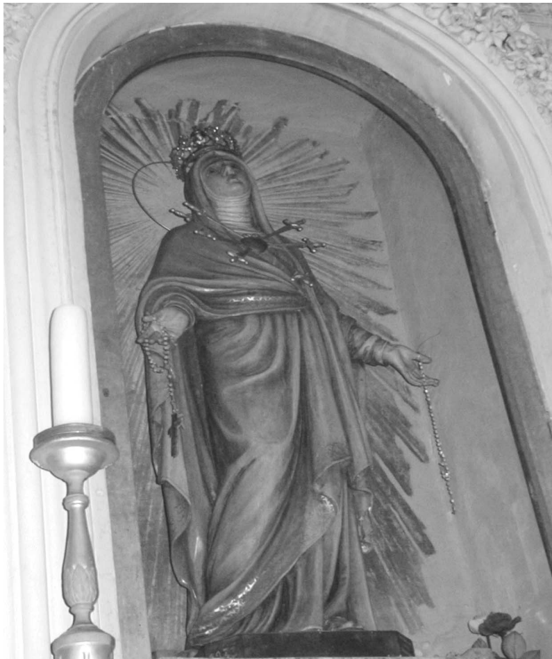
Vergine Addolorata circa 1880. Wooden statue in Santa Maria della Luce, Rome.