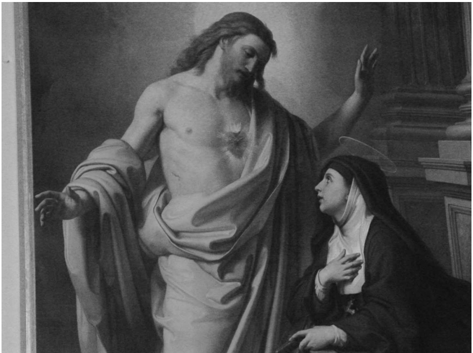
Francesco Podesti Gesù appare alla Beata Margherita Maria Alacoque , 1864, Città del Vaticano, Musei Vaticani.

I also remember that the day before I had visited the Vatican Museum, where one of the paintings had caught my attention: